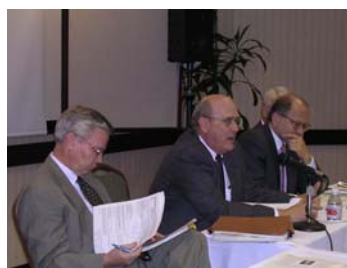
University representatives discuss state contracts, see page 3